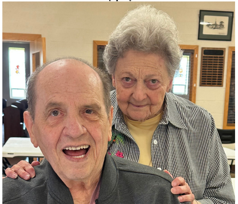
Their new address is 179 Edinburgh Drive, Ridge, NY 11961